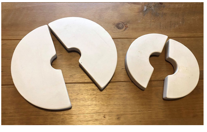
Figure 6. Examples of ceramic weights that can be used to keep vegetables submerged during fermentation.

A suitable-sized clean plate or glass pie plate can also be placed on top of the vegetables inside the fermentation container (fig. 7). The plate must be slightly smaller than the container opening, yet large enough to cover