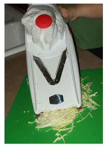
Figure 8. Mandolin. User is wearing a cut-resistant glove.

Evenly chopped or shredded vegetables will ferment more efficiently. Chopping and cutting will help release juices from the vegetables and allow the vegetables to become more evenly brined. Knives, mandolins, and kraut boards can be used to cut vegetables. Ensure that all cutting devices can be easily cleaned and are not made of materials that harbor microorganisms. Kraut boards and mandolins.