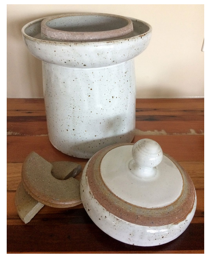
Figure 4 . Example of a ceramic crock that can be used for fermentation and ceramic weights that can be used to keep vegetables fully submerged during fermentation.

The shape or style of crock does not affect product safety but could affect quality. Many crocks are simple cylinders with or without fitting lids. If a fitting lid does not accompany the crock, a plate or similar cover can be used. It is important to cover the product for both safety and quality. Other crocks have specialized rims with grooves or gutters in which a lid fits snuggly within. The groove or gutter must be kept constantly filled with water to provide a seal that keeps oxygen out. These specialized crocks ferment better if the lids are not removed or disrupted, which might be difficult for curious cooks.