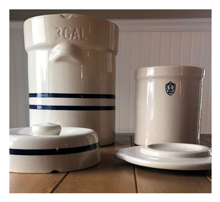
Figure 5. Example of 1- and 3-gallon ceramic crocks that can be used for fermentation.