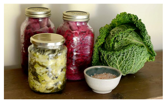
Figure 2. Photo of canned sauerkraut.