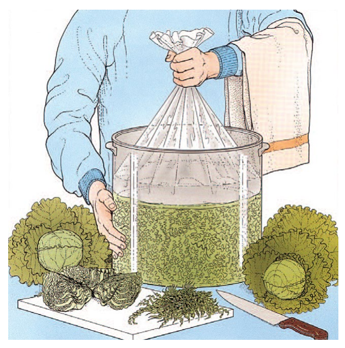
Figure 7. Weighting sauerkraut with a food-grade plastic bag and plate.

most of the vegetables. The plate can be weighted down with two to three sealed quart jars filled with drinkable water or heavy-duty plastic food bags filled with a brine solution. It is recommended that the brine solution be stored in plastic bags to ensure that the fermentation brine is not diluted should the bag leak or break. The brine can be made by mixing 4 1/2 tablespoons of salt for every 3 quarts of drinkable water. Covering the fermentation container opening with a clean, heavy bath towel or lid helps prevent contamination from insects and molds while the vegetables are fermenting.