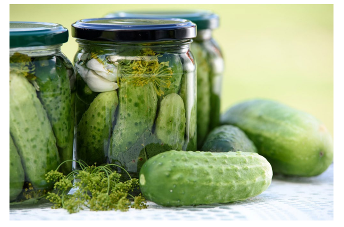
Figure 1. Photo of canned pickles.

People have been fermenting vegetables for centuries to increase the stability of fresh foods, make the foods safer to eat in the absence of refrigeration, and enhance their flavor (Hutkins 2019). Today, vegetable fermentation is done on a large-scale setting in factories as well as in households across the world. In the United States, the primary vegetables fermented are cucumbers (pickles; fig. 1) and cabbage (sauerkraut and kimchi; fig. 2). In many parts of the world, especially in developing countries where refrigeration is not common, fermented foods constitute a major portion of the diet.