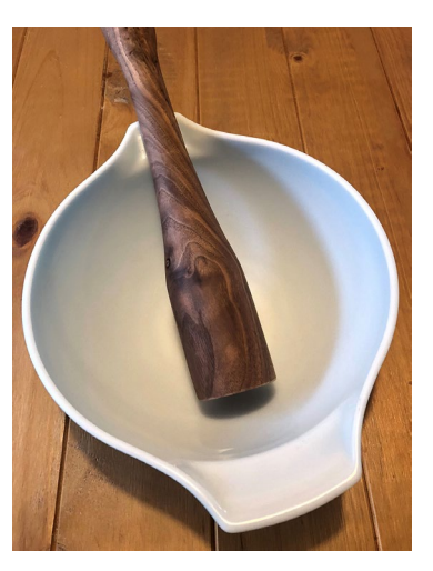
Figure 9. Example of a sauerkraut pounding tool.

quickly. Crushers, pestles, and sauerkraut pounders crush the vegetable tissue so that the juices will be released more readily. When choosing any cooking tool, make sure that it can be easily cleaned. Cleaned and gloved hands can also be used to mix and squeeze brined vegetables to release water and juices. Shredding, chopping, and slicing will also help liberate vegetable juices.